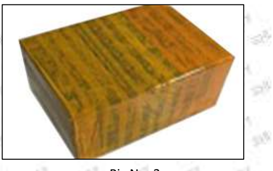
Pic No. 3 International express packaging: Wrapped with yellow tape after wrapping black protective film